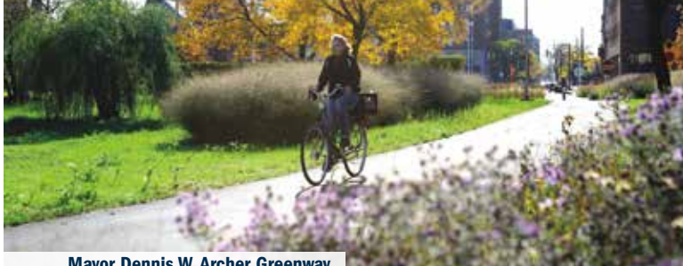
Mayor Dennis W. Archer Greenway

The Mayor Dennis W. Archer Greenway provides east side residents with safe and convenient access to the Detroit Riverfront along a beautifully-landscaped paved pathway.