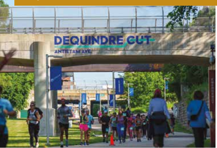
Between Atwater Street at the Riverfront and Mack Avenue in Eastern Market.

Formerly a Grand Trunk Railroad line, the nearly two-mile-long Dequindre Cut is a predominately below-street level greenway that runs parallel to St. Aubin Street between Mack Avenue and Atwater Street, just north of the riverfront.