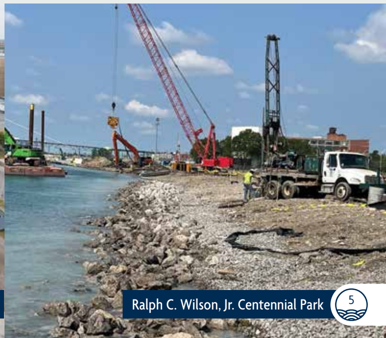
Ralph C. Wilson, Jr. Centennial Park