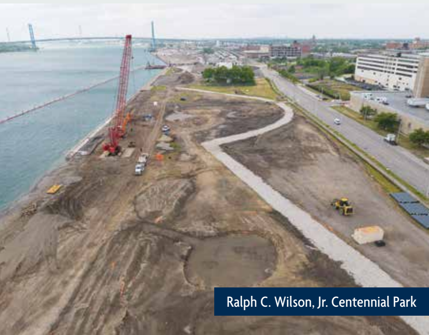
Ralph C. Wilson, Jr. Centennial Park