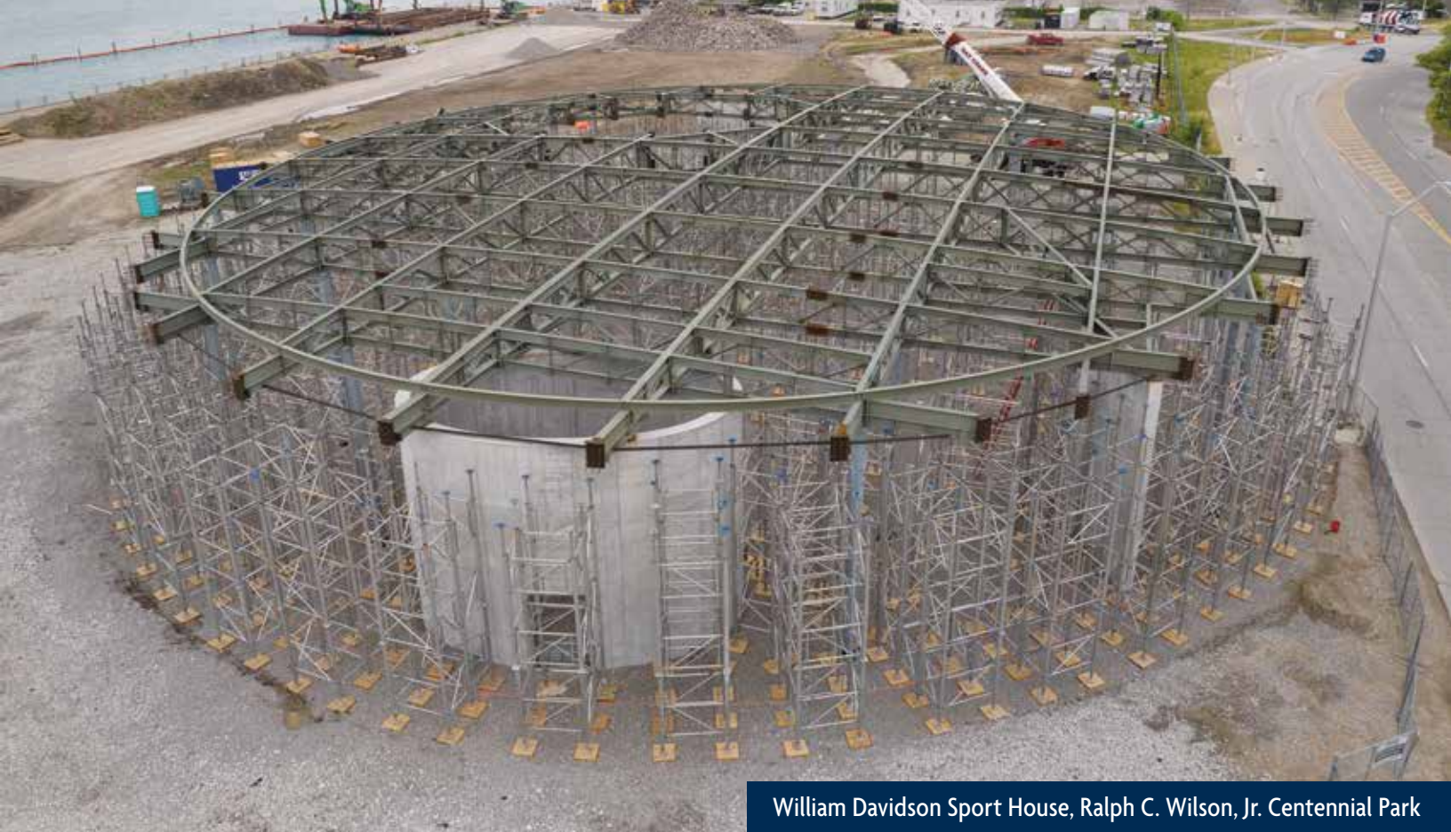
William Davidson Sport House, Ralph C. Wilson, Jr. Centennial Park

Elsewhere throughout the 22-acre property, significant site grading occurred over the summer months. The different levels and topographies of the various sections of the property can be viewed from the road. Underground utilities and storm water piping were completed during the summer as well.