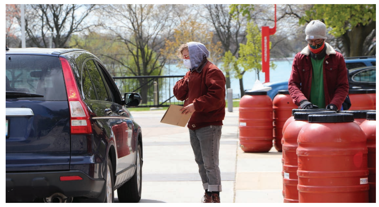
For more information and to purchase a barrel, visit https://mirainbarrel.com/signup/.